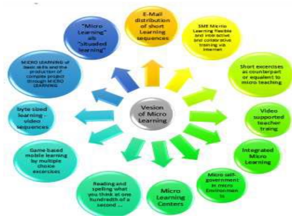
Figure 3. Versions of Micro learning (Hug, 2005)

(source-www.digitalpromise.org/micro credentials).