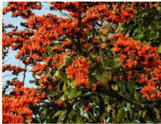
Fig. 1 - Palasha

Chemical Composition: Kinotannic acid, Galic acid