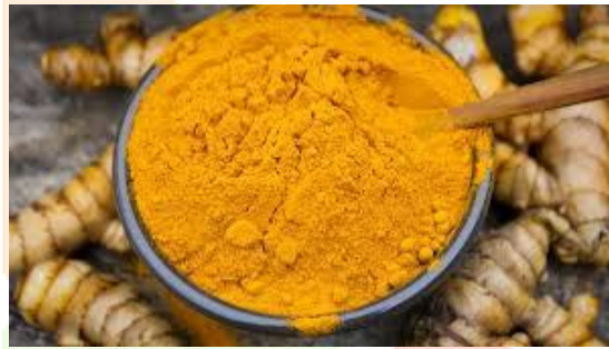
Fig.3 Haridra Churna

In this article, an effort has been made to throw an insight on preparation of Ksharasutra using Guggulu as a binding material instead of Snuhi khseera and usage of Palasha instead of Apamarga as a Kshara drug