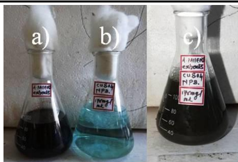
Fig 1. Phyto-reduction \text{Cu}^+ to Cu NPs presents change of colour from transparent to brown after 24 h incubation [a) A. Pallens leaf extract, B) \text{CuSO}_4 c) \text{CuSO}_4 with leaf extract].