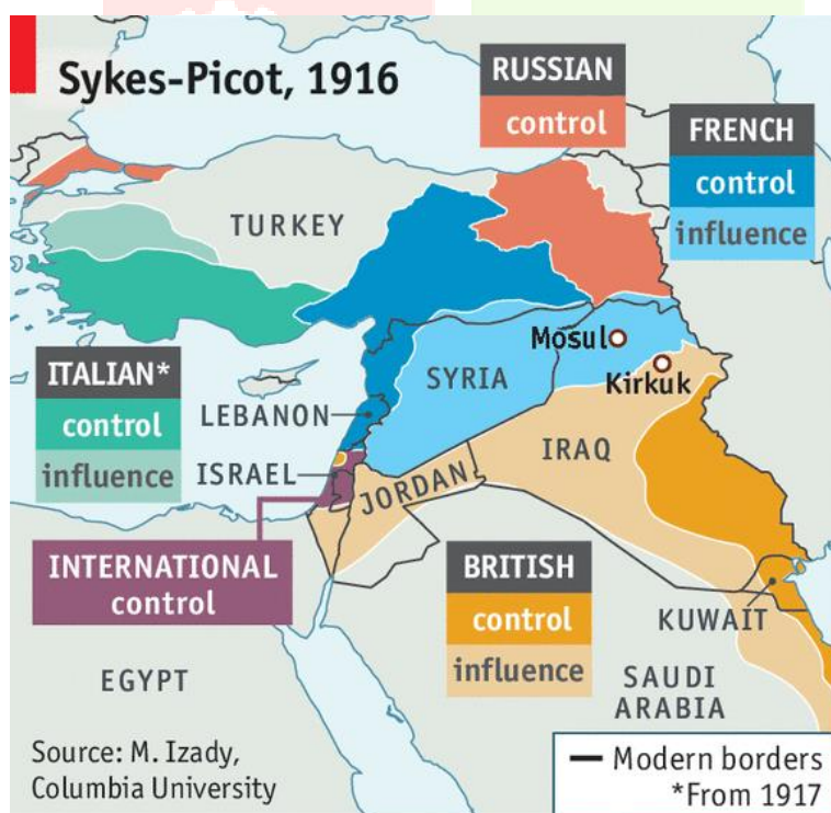
Figure 2: The Disputed Sykes-Picot Distribution of the Middle Eastsssss

The Concept of Pan Arabic identity, was popularized by Nasser Abdel Nasser, the leader of Egypt. It led to the short lived United Arab Republic during the 1960s. The Jasmine Revolution, commonly known as the Arab Springs Movement was started in Tunisia in 2010, it demanded democratic self determination and other civil liberties in the region of the Middle East. Other than these two movements, the Hussein-McMahon Correspondence along with the failed UNSCOP mission has led to two Gulf Wars and continuous unrest regarding the Eastern Bank, Golan Heights and statehood of Palestine.