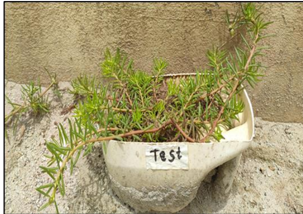
Fig 2 d) test plant image on day 25