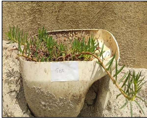
Fig 2 c) test plant image on day 1