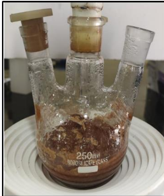
Fig. 1 b) Paddy straw-graphite oxide SAP gel composite