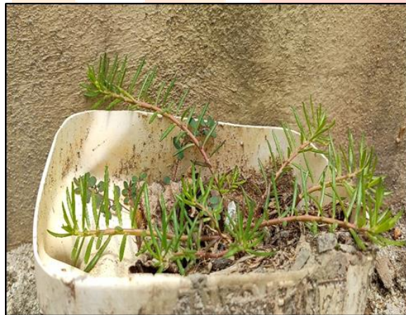
Fig. 2 a) control plant image on day 1

It was noticed that the control plant didn't show more growth. The test plant with fertilizer stick showed more growth and it was lush green in colour. The fertilizer stick was completely biodegraded for 60 days. It was also observed that test plant had a greater number of branches and flowers bloomed earlier compared to control plant.