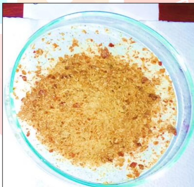
Fig. 1 a) Superabsorbent polymer dry powder obtained from paddy straw sample.

When the pH of the gel was 3.4 it was adjusted to 4-12 pH ranges in order to study the effect of pH. It was observed that the absorption capacity was maximum when the pH of the sample was 10. The gel formed after the reaction had 3.4pH which was adjusted to 10 by adding 1mol/l of freshly prepared KOH solution.