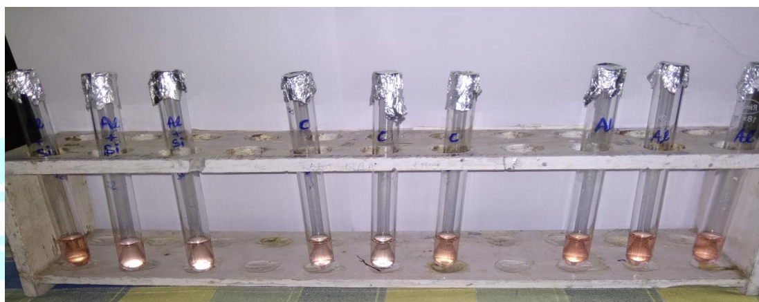
Figure 1: Aluminium uptake test using hematoxylin stain method.