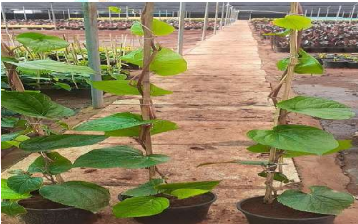
Figure 1: Piper Betel Pant