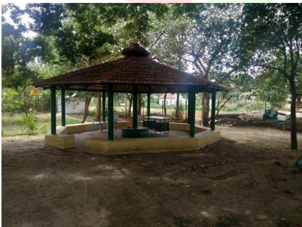
Rest Place Area