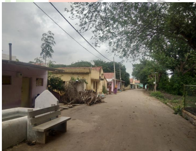
Tourist Birds Watching In Side Community Area