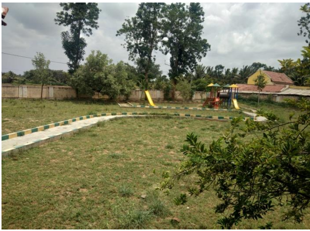
Children's Play Ground