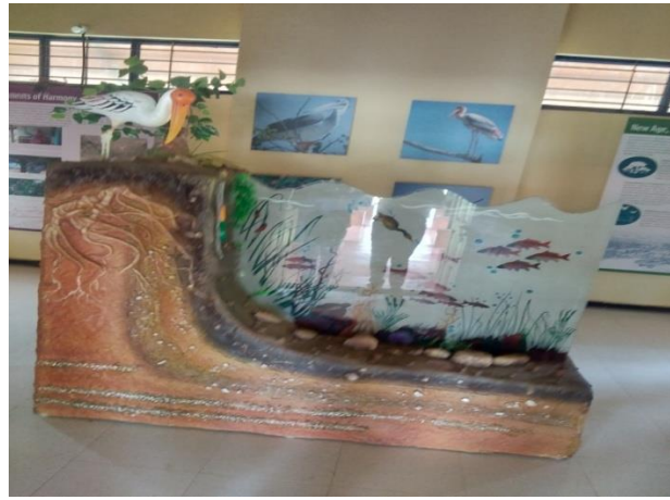
Stork Bird Gallery