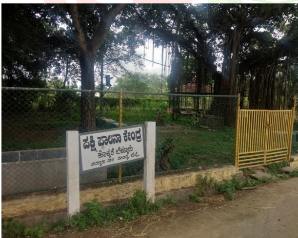
Stork Conservation Area