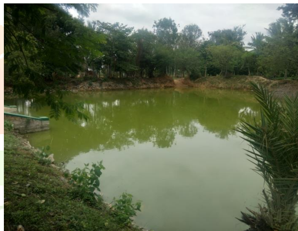
Man Made Pond