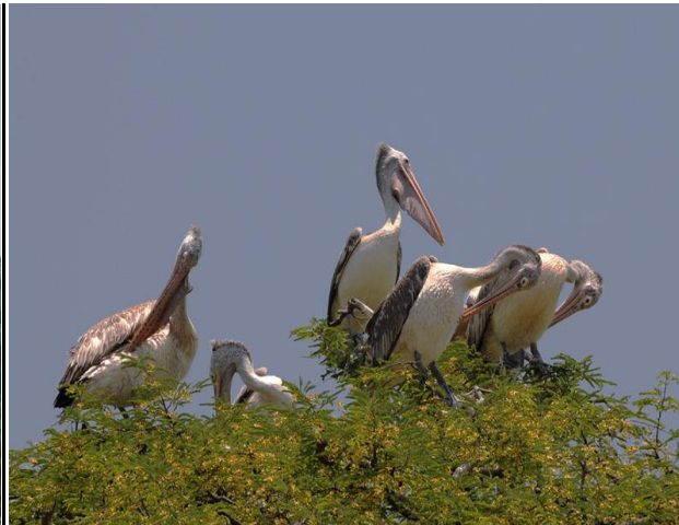
Storks Living Area (On Top Of the Tree)