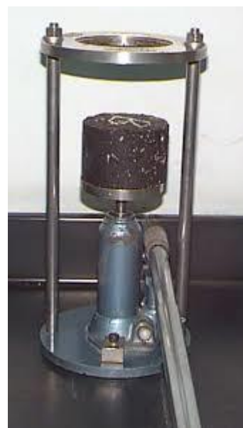
Fig.7.1.1. Marshall stability equipment