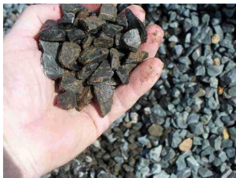
Fig.5.C.1. Coarse aggregate