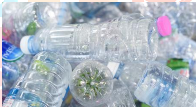
Fig.5.B.1 Plastic bottles

Plastic is a waste material in environment is a long-term usage . It can lead to toxic chemical into air , water , soil which cause health problem to environment . Hence it is necessary to reuse waste plastic to decrease this danger . When plastic waste is molten it acts as a binder as it is used in construction . It increases mechanical properties of road and decrease the construction cost .