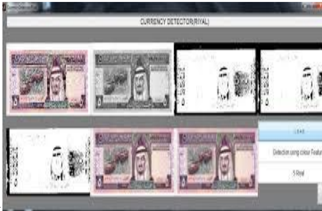
Fig. 1. Example of a currency detecting using web portal