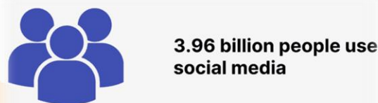
Fig no-2 How many people use social Media

Starting at 2021, the quantity of individuals utilizing social media is over 3.96 billion around the world, with the normal client having 8.6 records on various systems administration locales. Mainstream stages like Facebook have more than 66.09% of their month to month clients signing in to utilize social media every day.