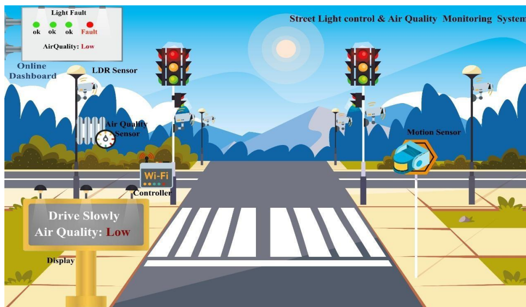
Figure 1.1 Prototype view of the proposed model

carbon dioxide (CO 2 ), particulates, Sulphur dioxide (SO 2 ) and lead. Emissions are related to use of the engine, mainly the fuel type and the temperature of combustion. If the engine is 100% efficient, then the products of combustion will be CO 2 and water (H 2 O). However, at low loads engines are inefficient and therefore the products of incomplete combustion dominate, for example CO and VOCs in petrol engines and carbon monoxide, VOCs and smoke in diesels. Air Pollution Monitoring System monitors the Air Quality over a webserver using internet and will trigger an alarm when the air quality goes down beyond a certain level, means when there are number of harmful gases present in the air like CO 2 , smoke, alcohol, benzene. The system will show the air quality in PPM on the dashboard so that it can be monitored very easily. In this IOT project, it can monitor the pollution level from anywhere using computer. This system can be installed anywhere and can also trigger some device when pollution goes beyond some level, like we can send alert in cloud.