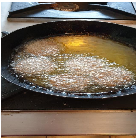
FIG-1. PREPATION OF FINGER MILLET CHAKLI