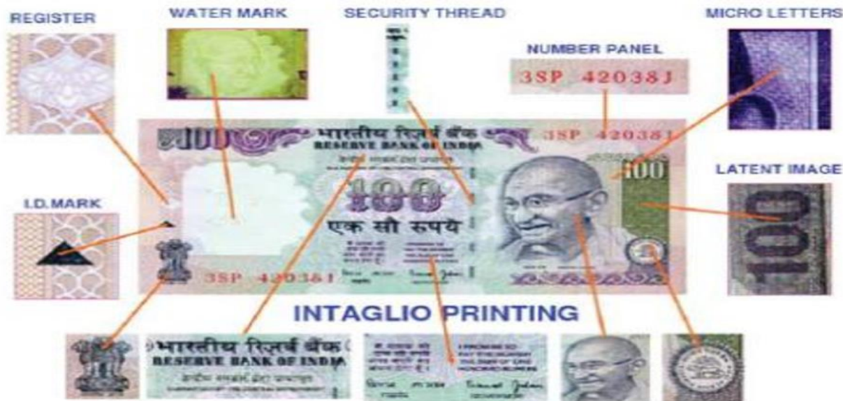
Figure 2. Indian Currency Recognition.

We firstly take out data from images that rooted out from an original and copied banknote. In regard to digitization, we use camera for printing in terms of inspection. The size of all images have 300x 300 pixels, this is because of the distance concerning lens and grayscale pictures having targeted some dots per inch to achieve. Properties and characteristics are explored and taken out from images in support of transformation concerning wavelet.