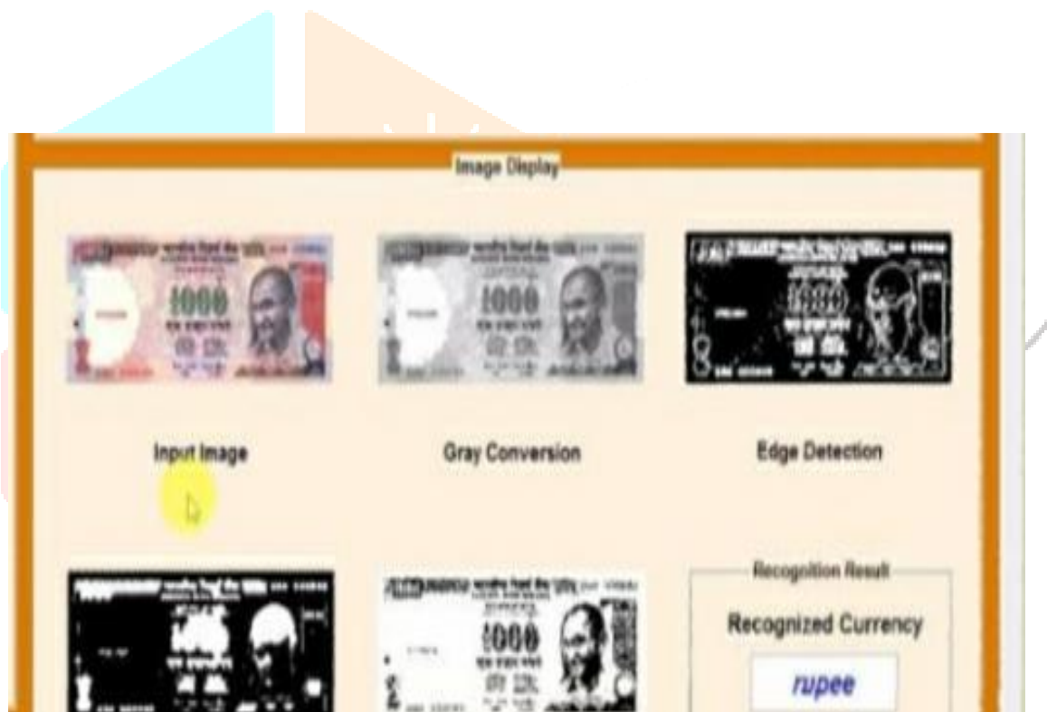
Figure 1. Indian Currency Recognition

Therefore another name referred as categorizing model grouped as data, consisting of attributes and labels for the bills referring as fake or genuine. Moreover it identifies decision boundaries which separate samples of two classes.