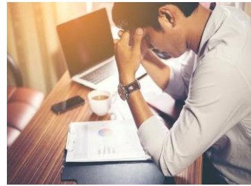
[Fig: 4 Stressful]

2.3 Stressful: Stress is a feeling of emotional or physical tension. It can come from any event or thought that makes you feel frustrated, angry, or nervous. Stress is your body's reaction to a challenge or demand. In short bursts, Stress as shown in the [Fig-4] can be positive, such as when it helps you avoid danger or meet a deadline