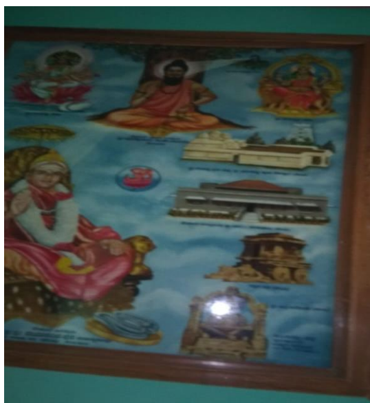
Jagadhgurus of Hampi Hemakuta Gayathri Peeta