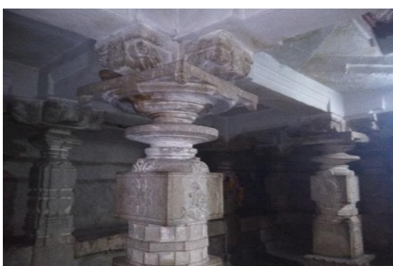
Inner side Of Gayathri Peeta