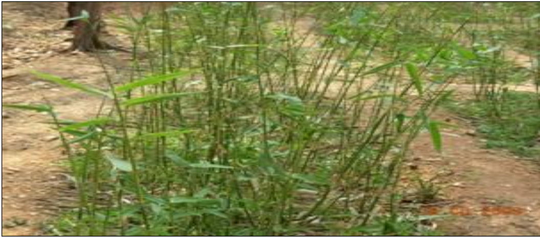
Bamboo nursery at Matha range