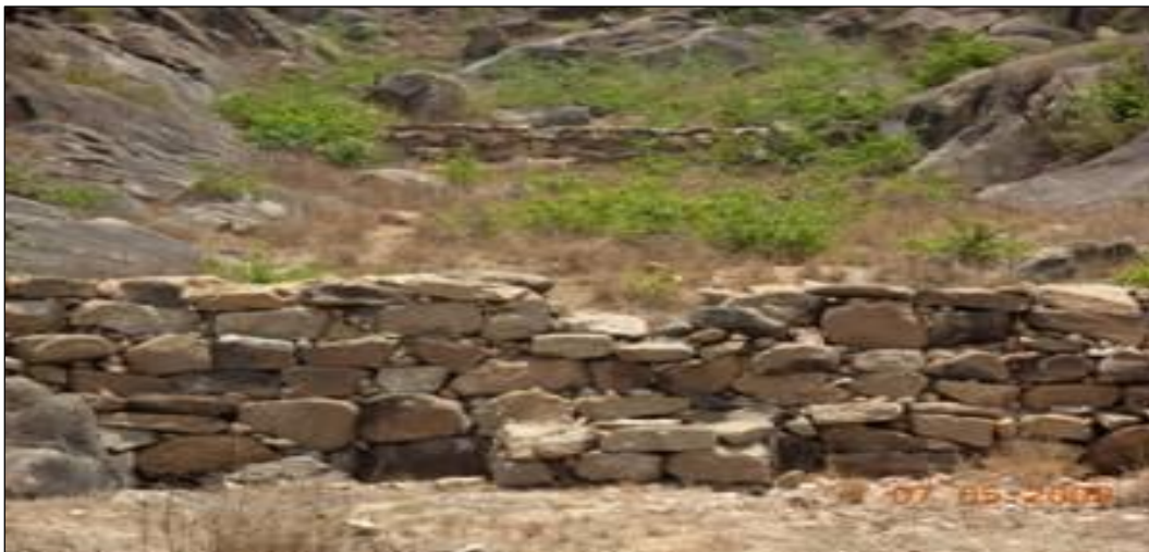
Rock Check Dam at Khatanga Mouza (NREGA) Kotshila Block.