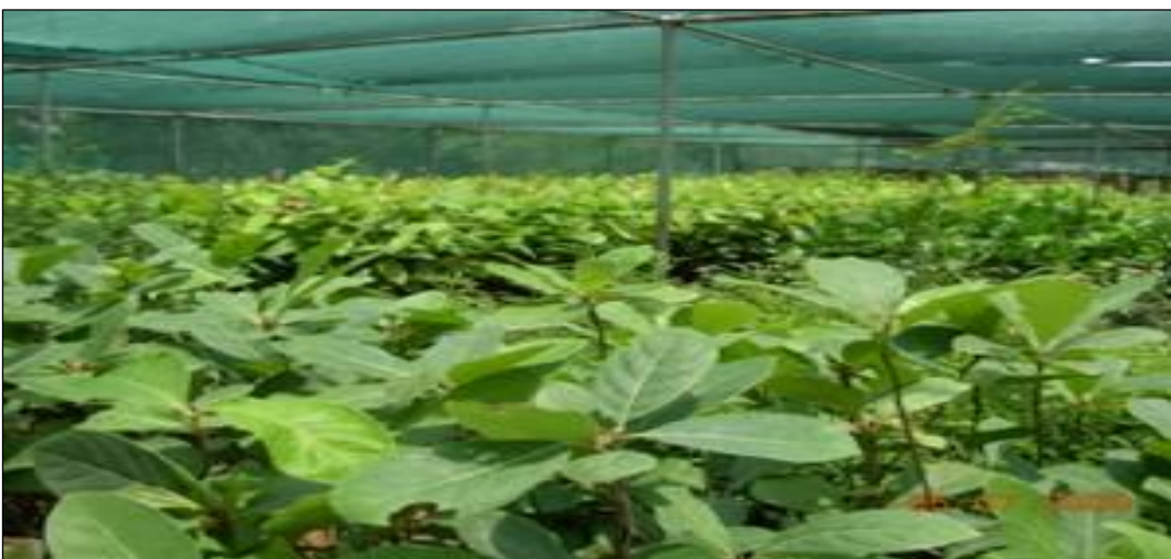
Balarampur Central Nurser

4.2 Wildlife: Biogeographically it represent zone 06B (Deccan, peninsula chotonagpur), there are 39 species of mammals (5 in schedule -1) (pangolin, wolf, leopard, cub, leopard, Elephants). 9 species of amphibians, 27 species of fish, 9 species of mollusk available in Purulia district (WB). Ajodhya hill ecosystem hosts few number mega mammals like elephant. Through major elephant habitat is engulfed by PPSP. At present number of such resident elephant is considered to be 8 to 10. A part from that the seasonally migrated herds of elephant from nearby Jharkhand forest take shelter in this area for a days together in different seasons of the year.