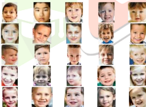
Figure 1: Images of Non-Autistic kids from Dataset [19]

Recently fMRI data is also being utilized to detect autism. Various functional and structural brain imaging datasets have been provided by Autism Brain Imaging Data Exchange (ABIDE) [8]. These images were collected from several brain imaging centers around the world. Preprocessed connectomes project (PCP) from the ABIDE has openly released 539 individuals who have ASD and 573 TD to the public. All these 1112 dataset consists of structured and pre-processed resting state functional MRI data along with phenotypic information. Many researchers have provided insight on using facial morphology to detect autism. Some of these methods involved physical measurement of facial features and then its data analysis in order correlate these measurements with the presence of Autism. One of the researchers released dataset containing images of children with Autism and without Autism [19]. The images in the dataset were gathered through various online sources. This data set contains 1667 images of Autistic children and 1667 images of Non-Autistic children. Facial features were used in order to perform Autism detection among kids. Fig 1 shows the images contained in the dataset.