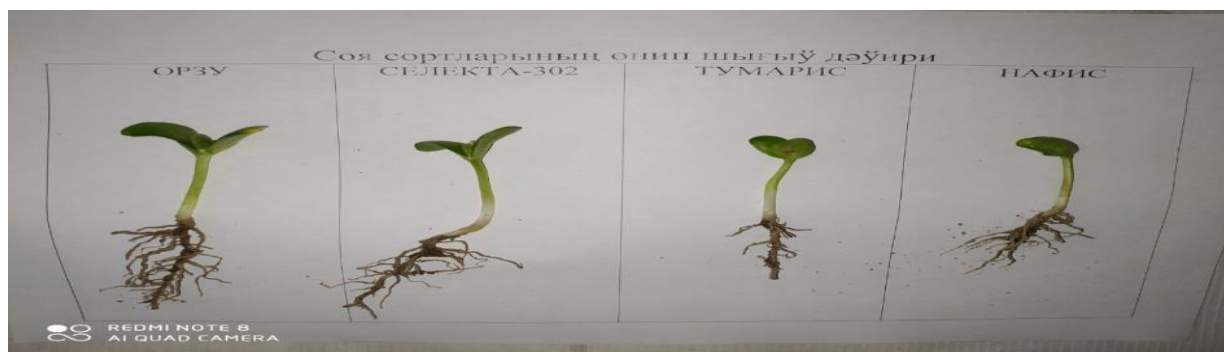
2-Picture. Greening of soybean varieties in field conditions

When we study the germination of soybean varieties in field conditions in practice “Orzu” and “Selekta-302” sorts “Tumaris” and “Nafis” distinguished by its well-developed compared to the varieties(pic 2).