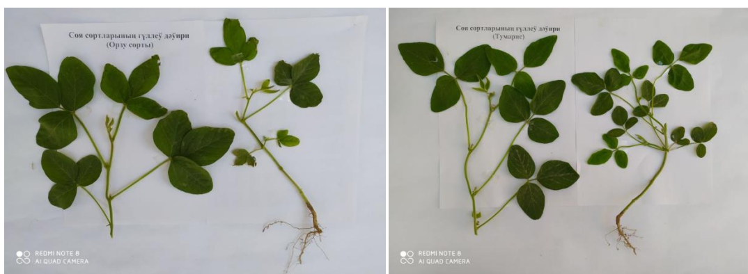
4- Picture.Soybean of Orzu and Tumaris branching phase of varieties.