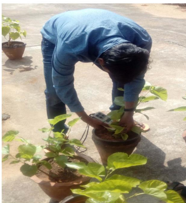
WATER STRESS INDUCED PHOTOSYNTHESIS MEASUREMENTS MULBERRY CULTIVARS