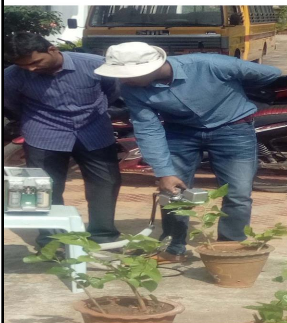
MEASUREMENTS OF PHOTOSYNTHESIS, WELL WATER MULBERRY CULTIVARS