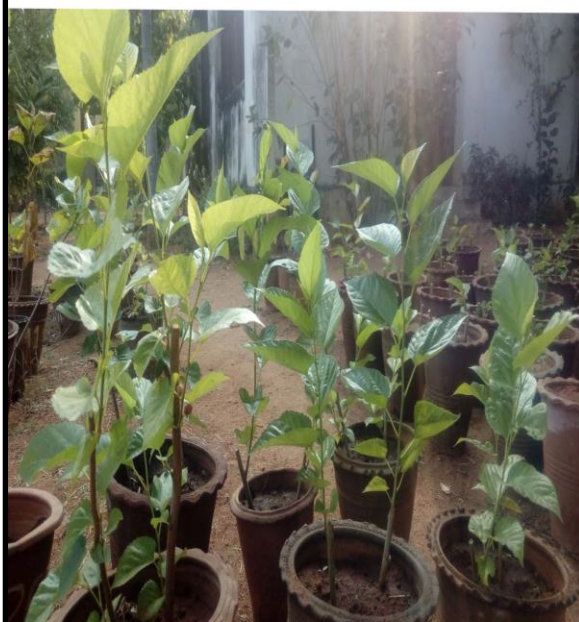
WELL WATER (CONTROL) MULBERRY CULTIVARS