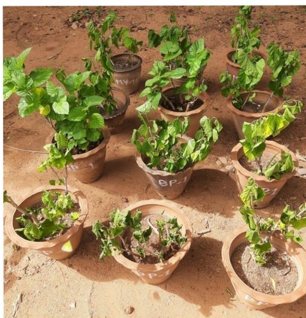
WATER STRESS (DROUGHT STRESS) INDUCED MULBERRY CULTIVARS