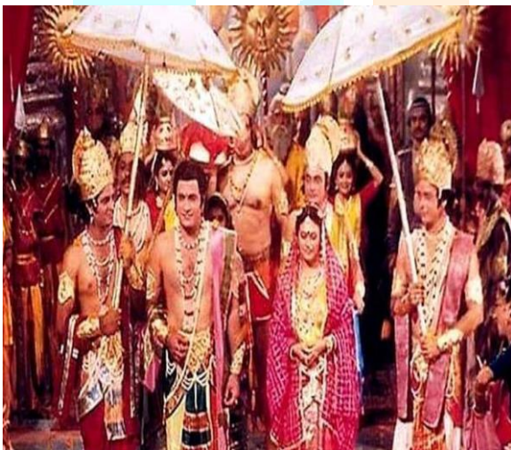
scene in Ramayan