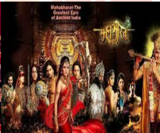
A scene in Mahabharat