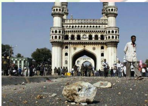
Figure.4. Charminar Hyderabad, Telangana, India [6]

In such a general public offers soundness to the social structure is the solidarity and coherence of the heredity, and of the more extensive gathering (the tribe) made out from continuously from an ancestor. For the individual, his essential obligations are those to ancestry. These incorporate obligations to the individuals now living, yet additionally to the individuals who have kicked the bucket and to the individuals not yet conceived. In the doing of these obligations this is controlled and roused by the mind boggling arrangement of slants of which may state that the protest on which that are focused is simply the genealogy, past, present and future. A basic overview of writing information on stone landmarks and monuments was joined with the after-effects of our examinations. None engaged from landmarks immunized on stone chunks varying in porosity and surface unpleasantness, high estimations of harshness and porosity.