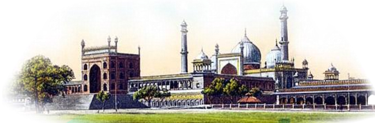
Figure.1. Monument, Delhi [1]

Monuments are an image of a critical time ever. Landmarks speak of life, passing, achievement, and battle just to give some examples. They have progressed toward becoming as essential to society as the occasions they speak to. They bring history alive to new ages and recollections to the individuals who encounter them first-hand. Monuments make an extension between ages. Numerous guardians feel an unquestionably unbelievable bliss when they see the look in their kid's eyes they had went they saw a similar landmark.