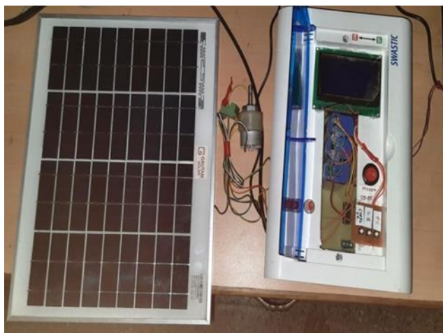
Figure-3 Hardware Model

A photograph of the experimental setup constructed at the laboratory is shown in Figure-3