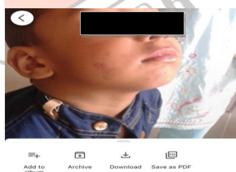
Thu, 27 Aug 2015 · 10:14 AM Fig 4: 27/08/2015