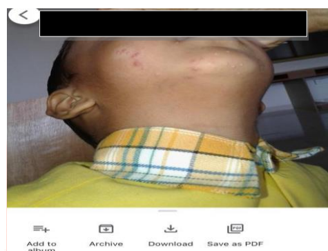
Thu, 18 Jun 2015 · 10:46 AM Fig 2: 18/06/2015