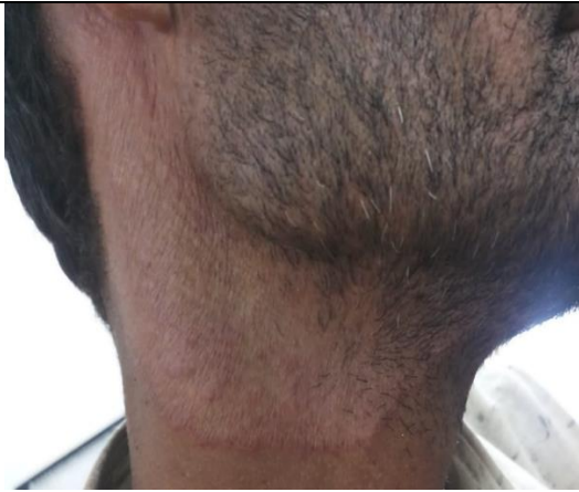
Lesion at the neck and face before treatment