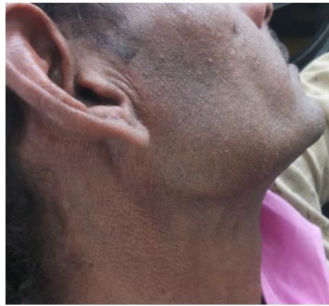
Lesion at the neck and face after treatment