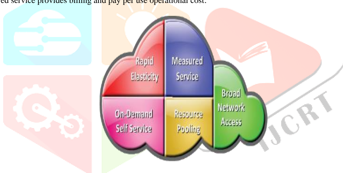
Figure 2. Cloud Computing Characteristics

The NIST characterizes figuring is a model for empowering pervasive, helpful, on-request arrange access to a common pool of configurable processing assets (e.g systems, servers, stockpiling, applications, and administrations) that can be quickly provisioned and discharged with negligible administration exertion or specialist organization communication [14]. Rapid elasticity refers quickly and efficiently. An automatically without any service interruption. Metered service provides billing and pay per use operational cost.