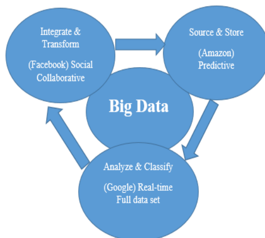
Figure 1. Big Data

The Figure 1 shows that data generating from various sectors. These data are considered as Big Data.