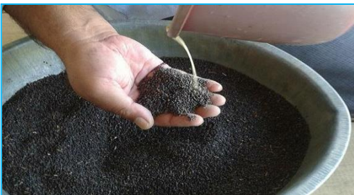
Fig 5: Soaking of seeds in cow milk