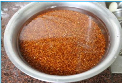
Fig3: Soaking of seeds in water