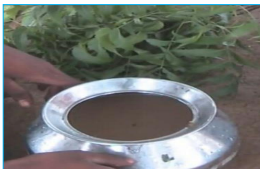
Fig 3: Cow urine