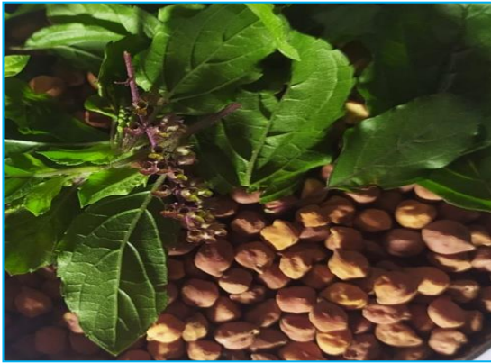
Fig7: Seeds mixed with tulsi leaves