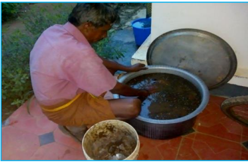
Fig7: Soaking of seeds in cow dung