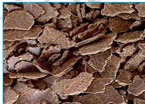
Fig 4: Oil cakes