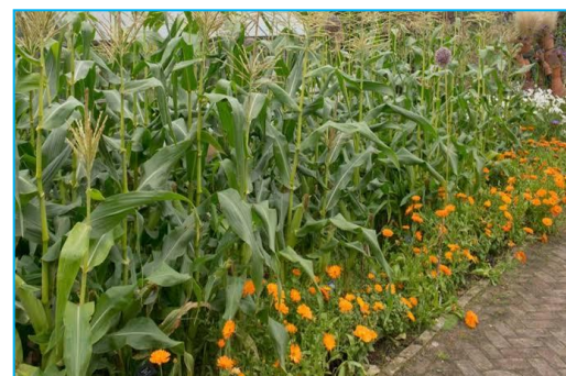
Fig 4: Marigold flowers with maize