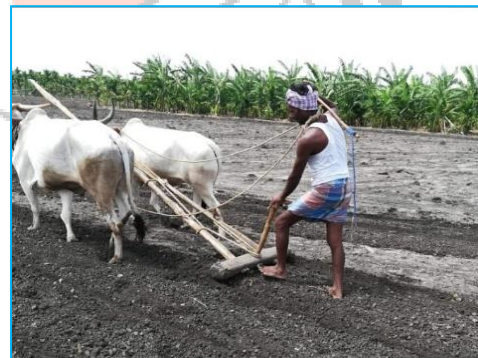
Fig4: Plough with leveller