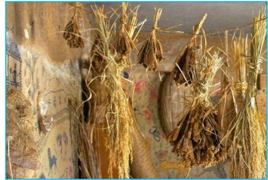
Fig16: Unhusked ears tide