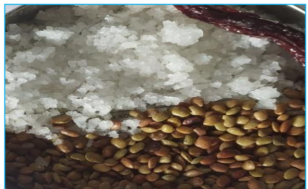
Fig4: Storage of pulses with salt