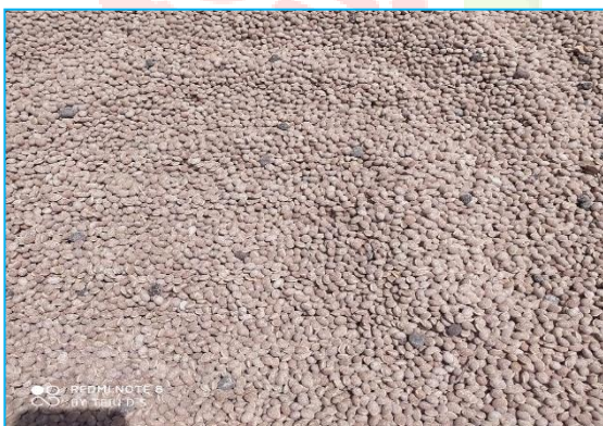
Fig5: Seeds mixed with lime powder