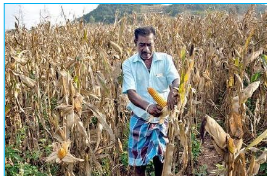
Fig2: Harvesting by hand method