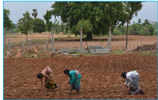
Fig2: Sowing by dibbling method