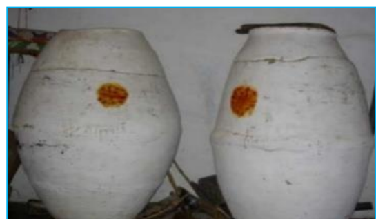
Fig14: Large mud jars