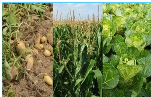
Fig 11: Crop rotation