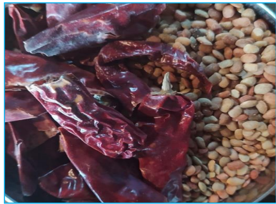
Fig8: Seeds mixed with dry chillies