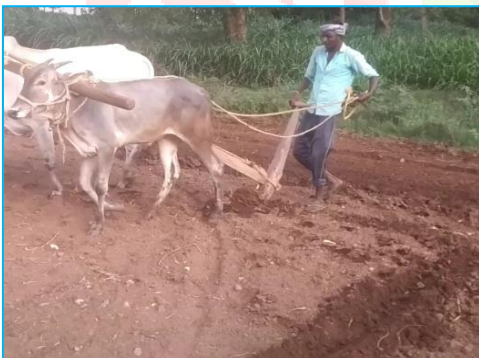
Fig3: Plough with wooden plough