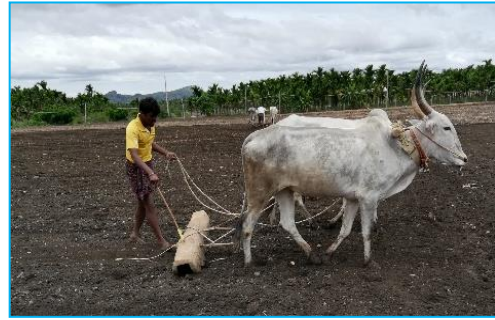
Fig8: Levelling of soil