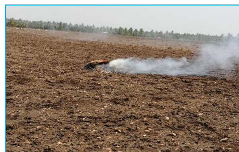
Fig6: Burning of plant residues