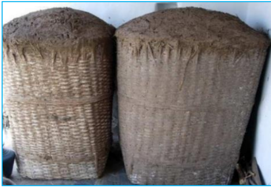
Fig15: Bamboo storage structure