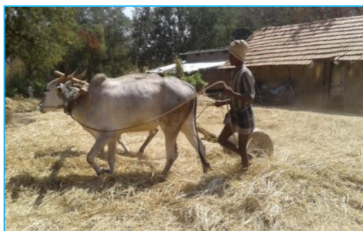
Fig4: Threshing by using animals