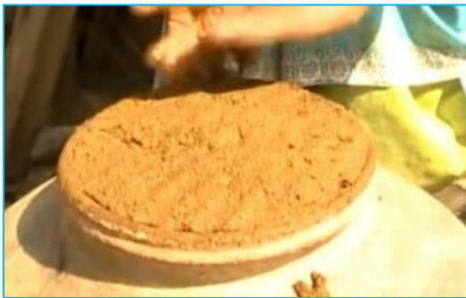
Fig9: Plastering by clay