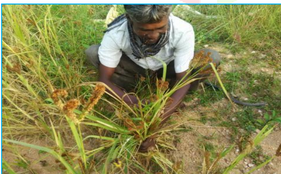
Fig1: Harvesting by using sickle

Scientific Relevance: Drying of seeds under sun helps to kill the harmful bacteria and fungi if present on the surface of seeds, which causes fungal or bacterial disease to seeds or grains during storage, and it also helps to attain optimum moisture level of seeds or grains.