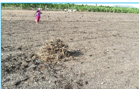
Fig5: Cleaning and weeding