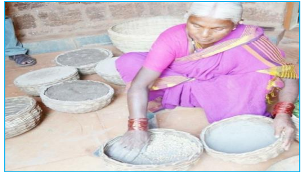
Fig2: Seeds mixed with ash