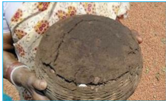
Fig10: Plastering by cow dung