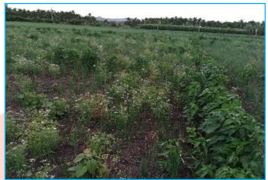
Fig 8: Mixed cropping