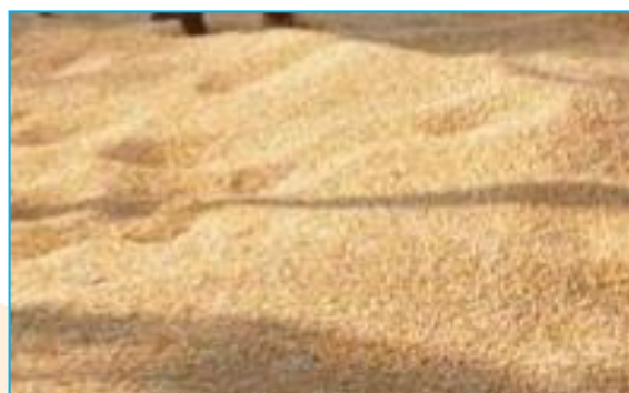
Fig6: Sun drying