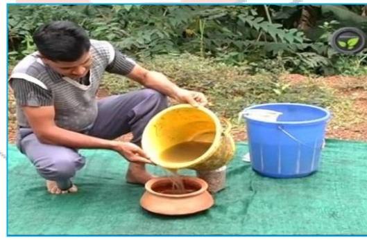
Fig4: Soaking of seeds in cow urine