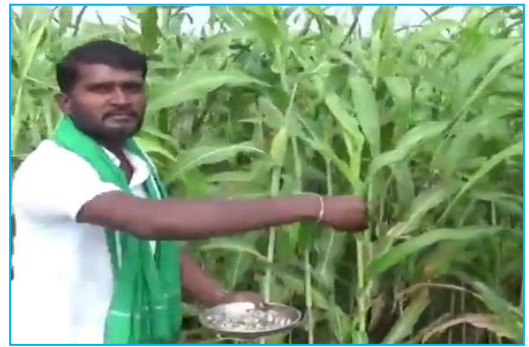
Fig 6: Spreading of charaga