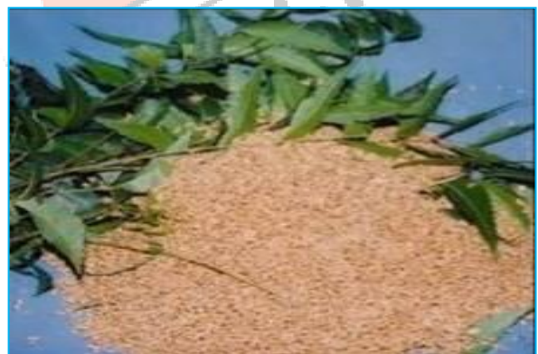
Fig6: Seeds mixed with neem leaves