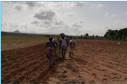
Fig1: Sowing with seed drill

Scientific Relevance: Covering of soil after sowing help to prevent the loss of seeds by wind or rain and also protect the seeds from birds picking.