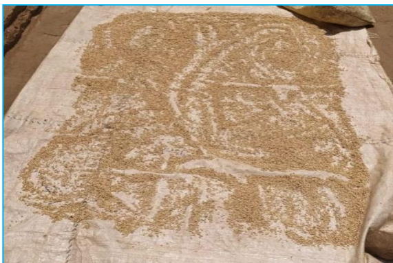
Fig3: Sun drying of grains