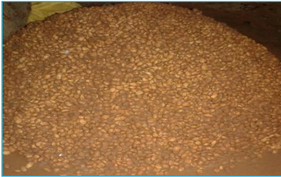
Fig1: Red soil coating