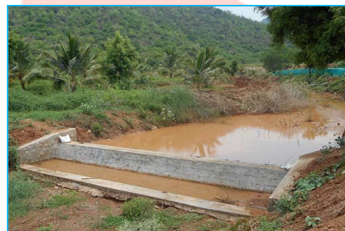
Fig 4: Katte