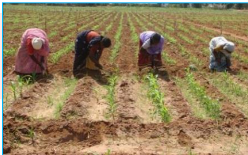
Fig1: Removal of weeds