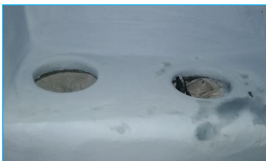
Fig13: Earthen pots