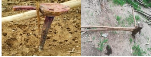
Bamboo seed drill(sedde)