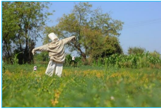
Fig 5: Bird scarers