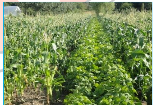
Fig 10: Growing of legumes