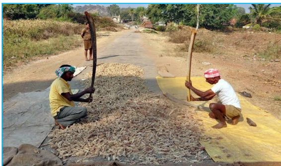
Fig3: Threshing by hand method