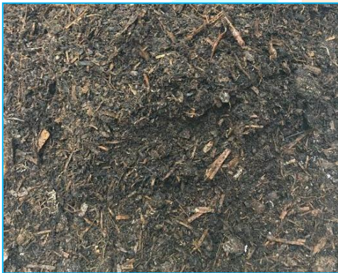
Fig1: Farmyard manure

* These manures also act as fertilizer, and also have some, pesticidal, fungicidal, insecticidal, property, So that they can fight against soil borne pathogens which cause diseases.