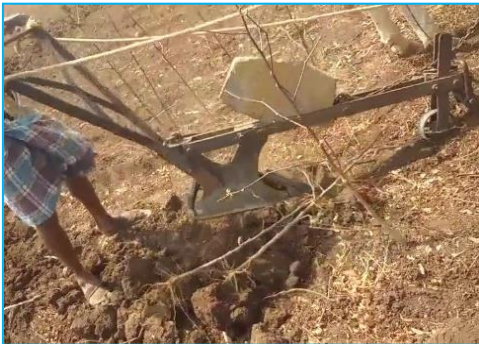
Fig1: Plough with mould board plough

Scientific Relevance: Cleaning helps to easy percolation of water in to the soil, weeding prevent cross pollination, and also prevent use of nutrients from unwanted plans.