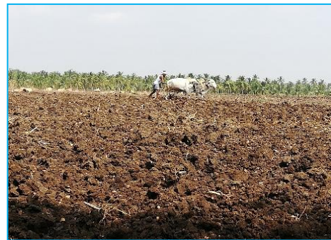
Fig2: Plough with iron plough