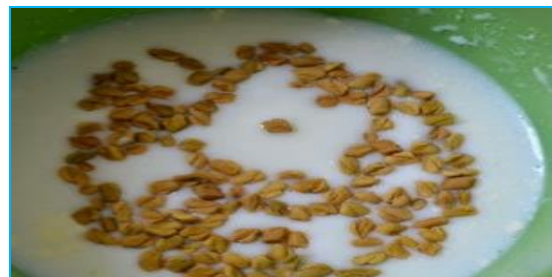
Fig6: Soaking of seeds in butter milk