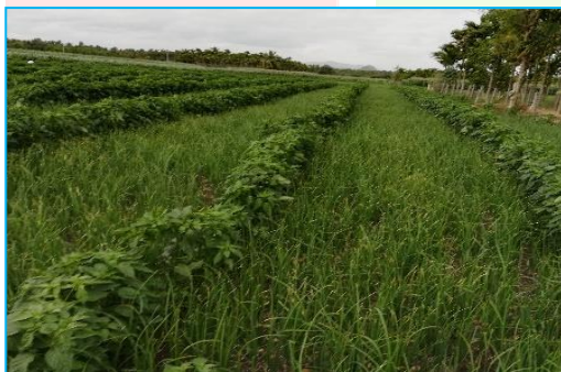
Fig 9: Inter cropping