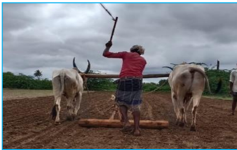
Fig9: Levelling of soil by leveller