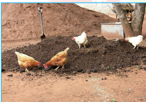
Fig3: Poultry manure