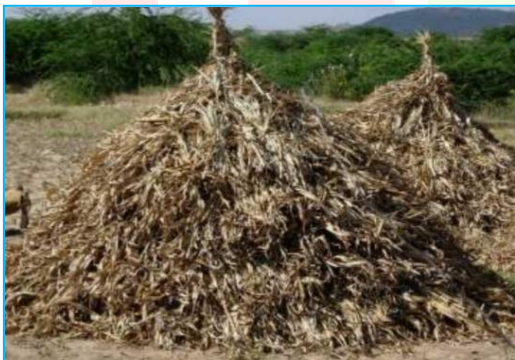
Fig11: Temporary corn storage