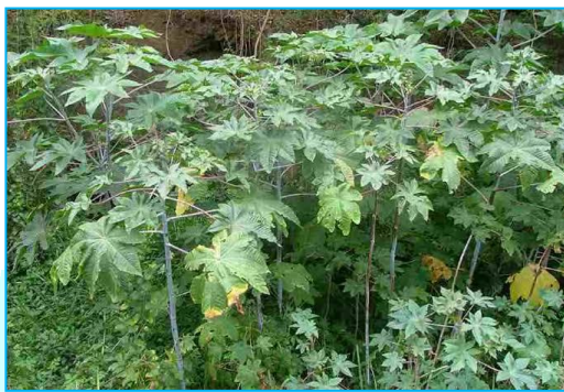
Fig 7: Growing of border crop