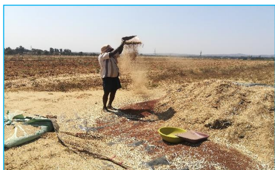
Fig5: Wind winnowing