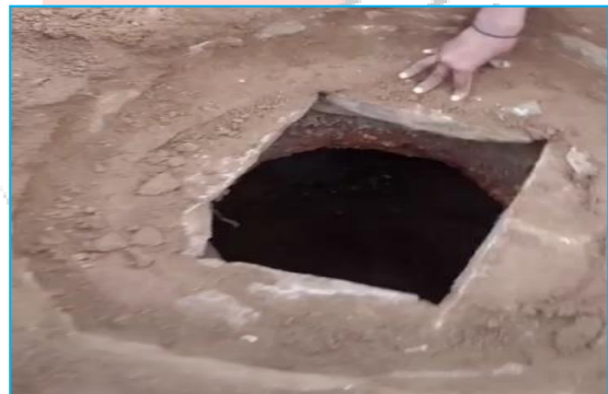
Fig12: Underground storage pit