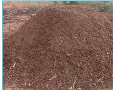
Fig2: Sheep and goat manure