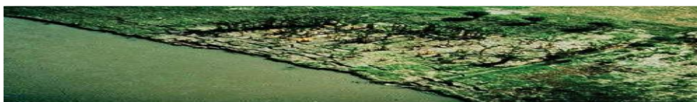
Figure 1.3: Cyclic mobility during Guatemala earthquake 1976