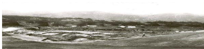
Figure 1.2: Flow liquefaction damage during Alaska earthquake, 1964

Figure 1 shows inter-granular contact before and after liquefaction. These phenomena can be divided into two main categories: flow liquefaction and cyclic mobility.