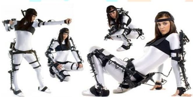
Image courtesy Motion Capture of Human for Interaction with Service Robot

In this system motion capture is done by inside in system where the structure is linked by potentiometers, gyroscopes or angular measurement devices located at human joint locations. It is the process in which the character wears a skeleton structure also called exoskeleton helps in capturing and tracking human joints and angle movements. The sensors are placed on each joints of skeleton for full body motion capture. At least 15 sensors are needed to capture body movement. Each sensor measures 3D orientation.[2]