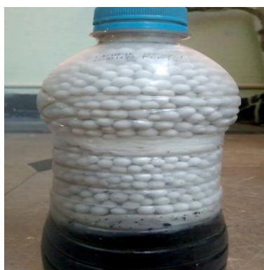
Fig.2 Filter layers