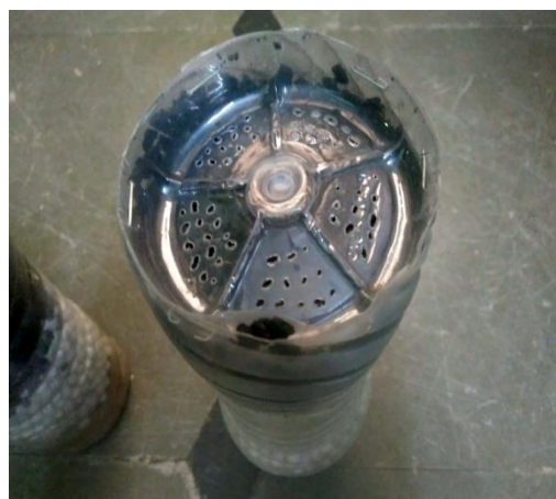
Fig.3 Filter bottom side (Exit)