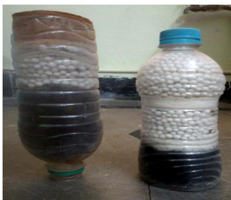
Fig.1 Filters (proto type) front view