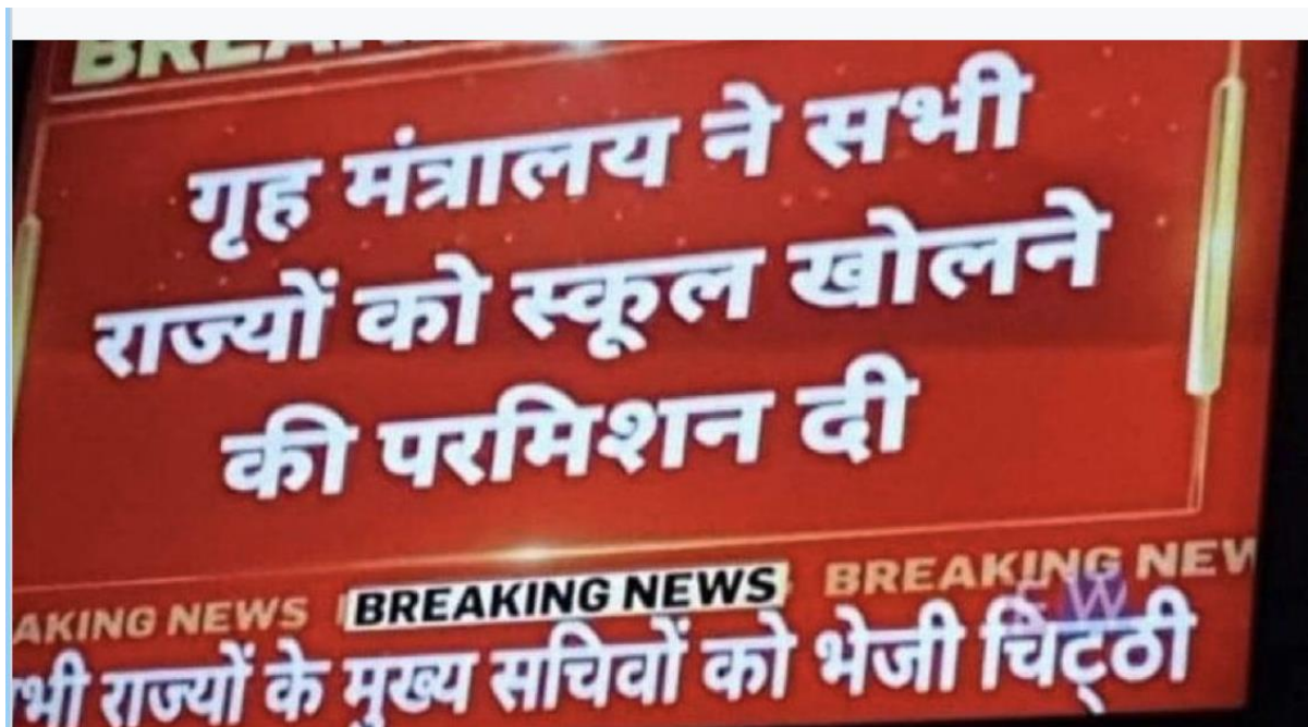
Screen Grab of PIB Fact Check- Source- Twitter (PIB)

Image extract of the News Clip from India News Hindi Channel- Source- Twitter (PIB)