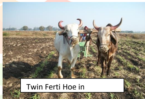
Twin Ferti Hoe in