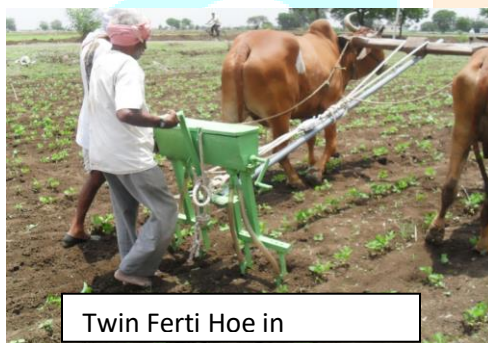
Twin Ferti Hoe in