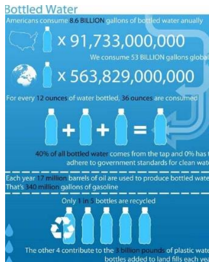
Figure 1: Indicates the consumption of plastic waste by Americans