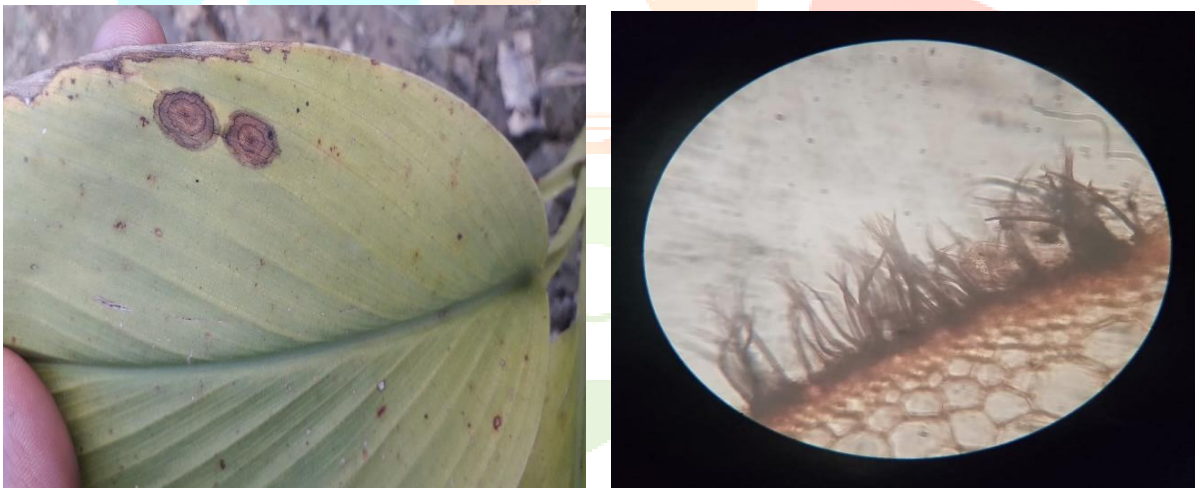
Fig: Symptoms observed in experimental plot & Microscopic view of setae