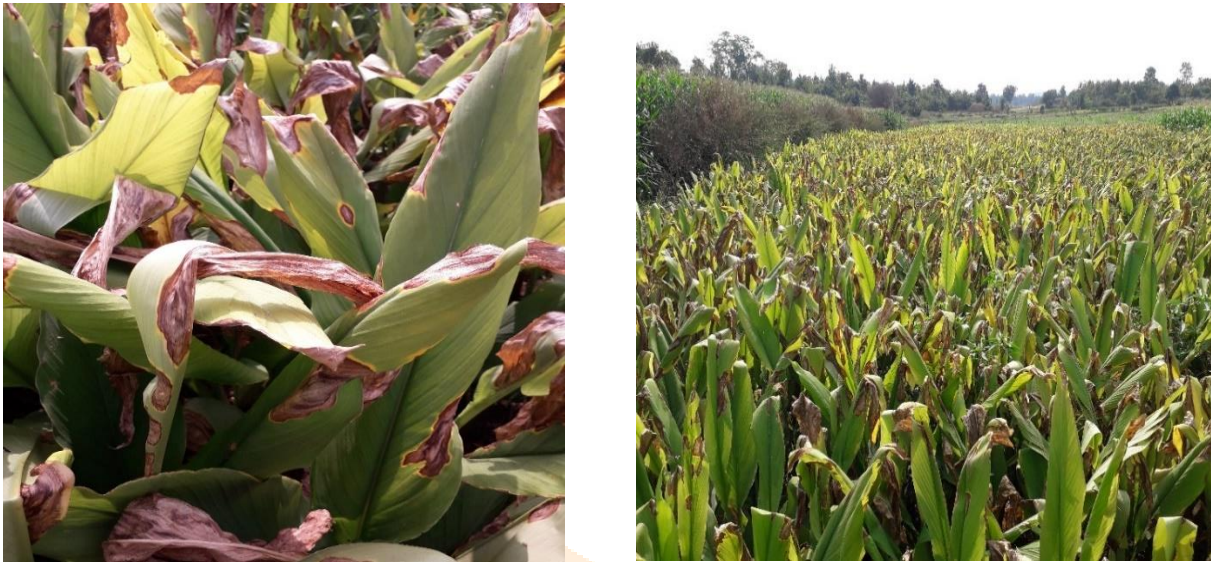
Fig: symptoms observed in Farmer's field during survey

transferred to PDA slants and petriplates and incubated at 25^{\circ}\text{C}\pm 1^{\circ}\text{C} and pure culture thus obtained through hyphal tip was maintained. Multiplication of pathogen was done by using potato dextrose agar media.