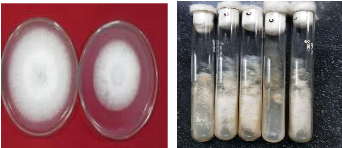
Fig: pure culture of C.capsici