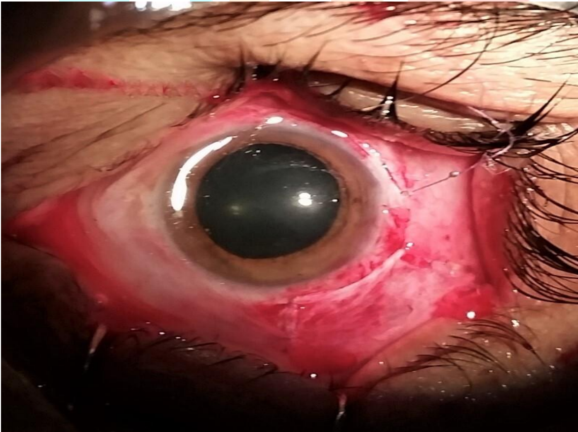
Figure 2 Immediate post-operative image after tumor resection and closure of the conjunctival defect