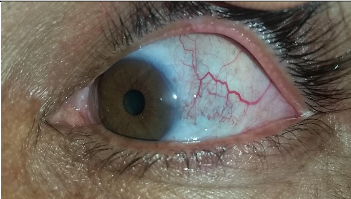
Figure 5. At the 6th-month follow-up a slit-lamp examination revealed no sign of recurrence or any postoperative Complication