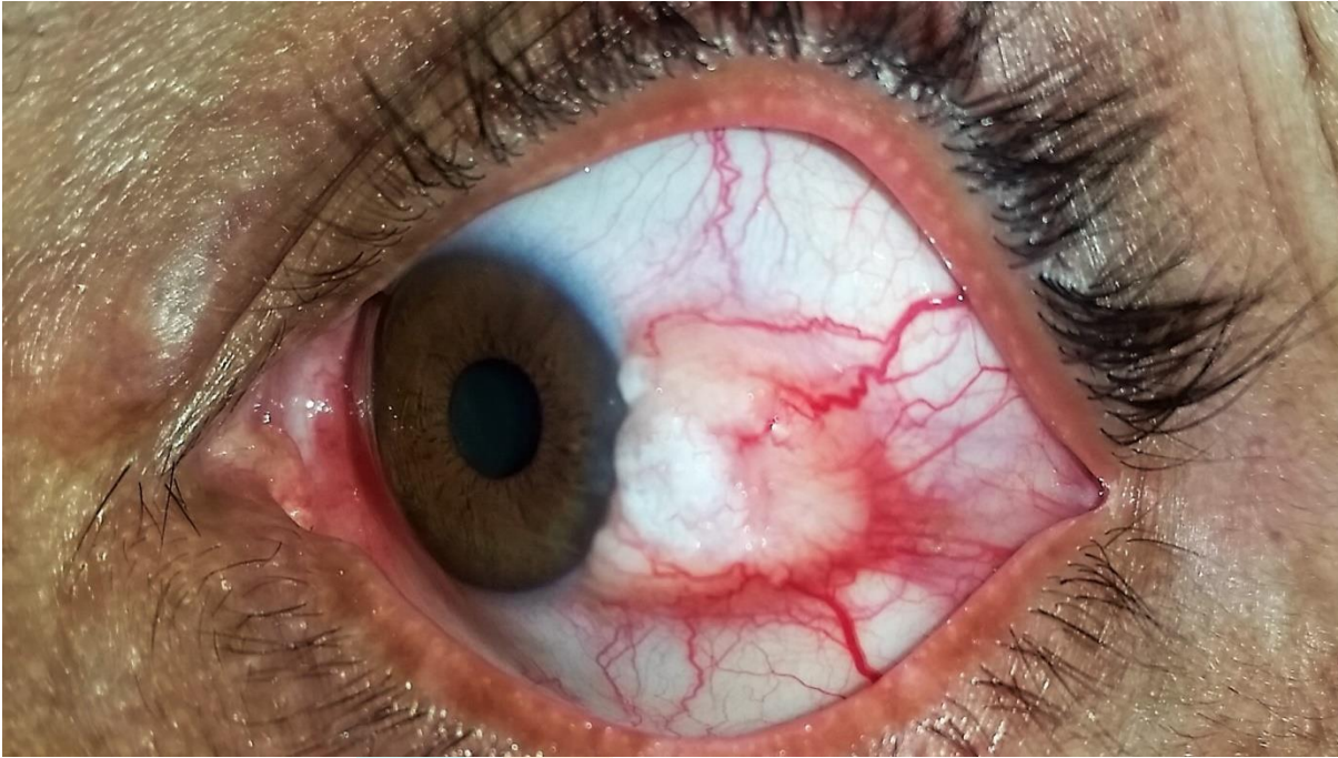
Figure 1. Initial slit-lamp image showing a gelatinous, tumorous lesion and inflammation on the temporal bulbar conjunctiva of the left eye.