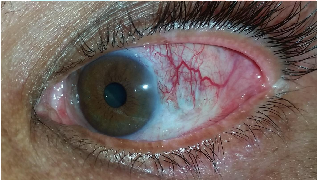
Figure 4. At the 1st-month follow-up a slit-lamp examination revealed a satisfying with tissue regeneration and decreased peri-lesional neovascularization.