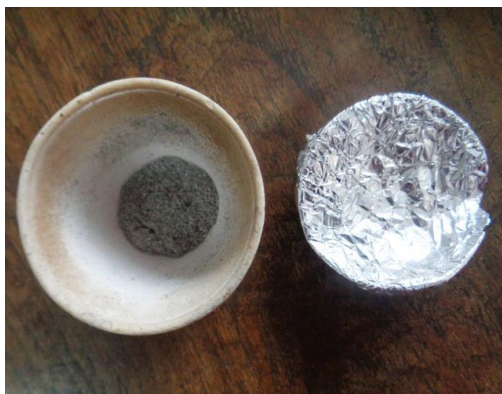
Fig. 3: Ash of Stachytarpheta jamaicensis (L.)