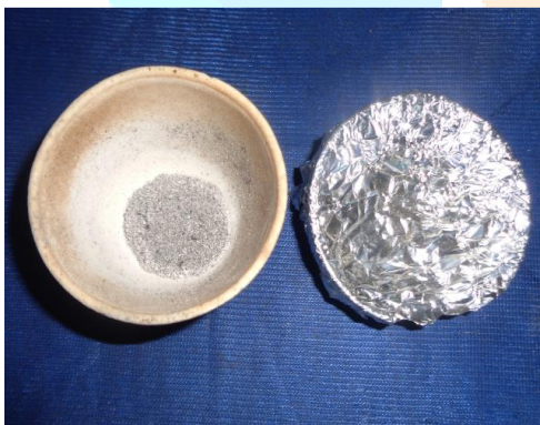
Fig. 1: Ash of Duranta erecta L.