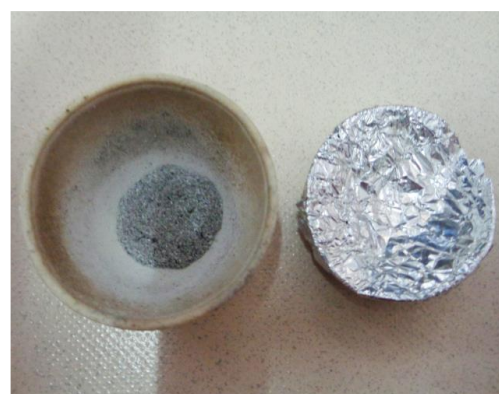
Fig. 4: Ash of Lippia alba (Mill.) N.E.Br. ex