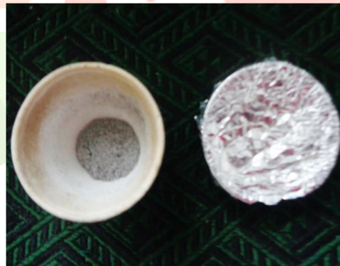
Fig. 2: Ash of Phyla nodiflora (L.) Greene