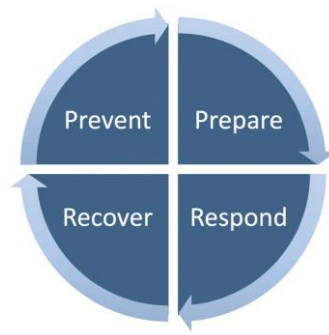
Fig.1 PPRR risk management model