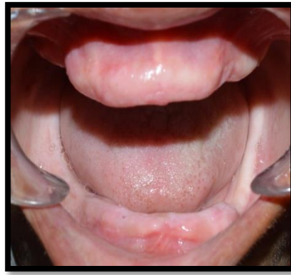
Figure 1: Pre Treatment Intraoral