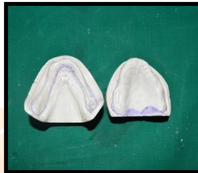
Figure 3: Preliminary Cast