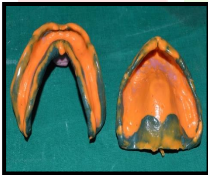
Figure 4: Final Impression