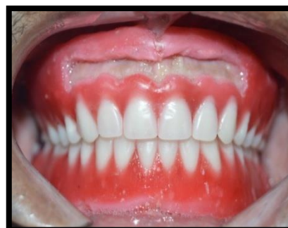
Figure 7: Try in