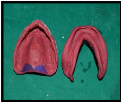
Figure 2: Preliminary Impression