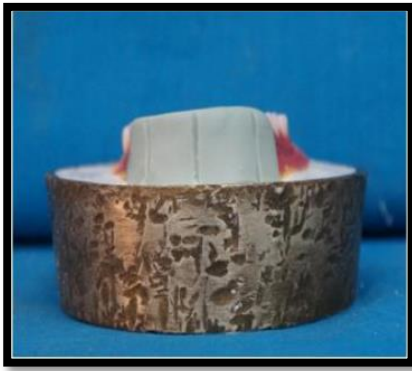
Figure 8: Putty was indexed during Processing