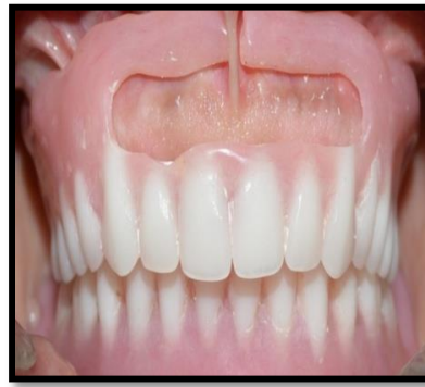
Figure 9: Denture Insertion