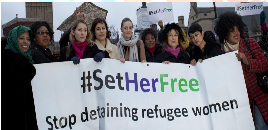
Figure 2. Stop detaining women refugee

The detention of women with the men also increases their vulnerability. According to Strasbourg court the violation of the European Convention on Human Rights has been seen many a time and reason behind it was substandard detention conditions (Nobel Women's Initiative, 2016).