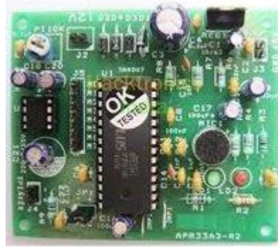
Fig: Audio Voice Recorder &amp; Playback