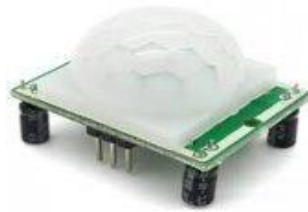
Fig: PIR Sensor