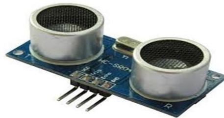
Fig: Ultrasonic Sensor