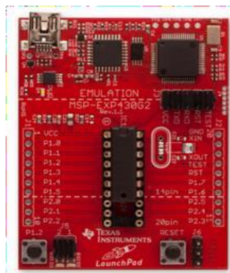
Fig: Mixed Signal Processor