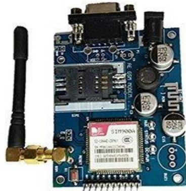
Fig: GSM Module