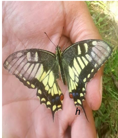
old world swallowtail