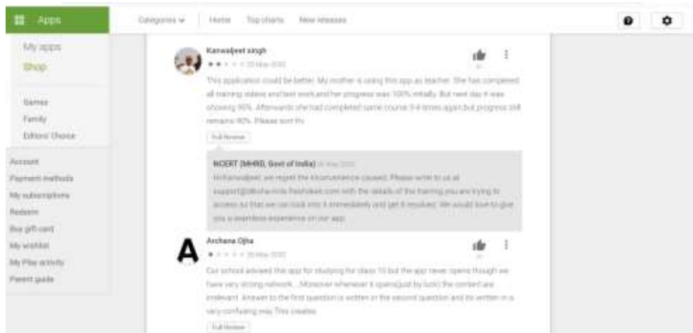
Fig 2- Complaints regarding the implementation of the app.