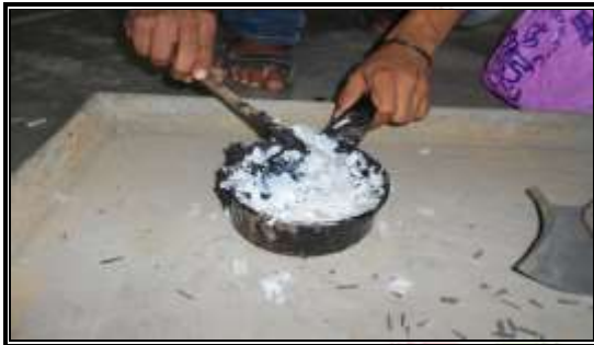
Figure 2.1: Mixing of shredded Waste plastic Aggregate and Bitumen