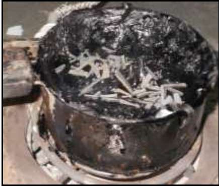
Figure 3.3: Making Bituminous Rubber Mix