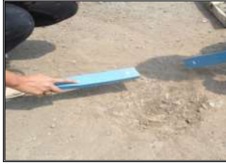
Figure 3.2: Cleaning of pot hole by using wire brush