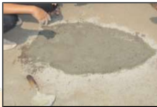
Figure 4.4: Finishing of pothole