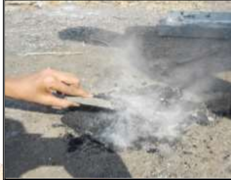
Figure 3.4: Pouring of mix in pothole