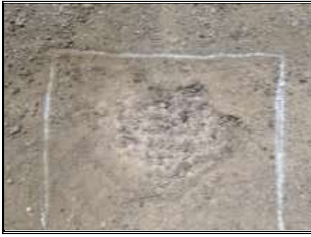
Figure 3.1: Selection & marking of pot holes