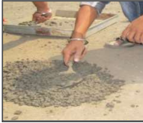
Figure 4.2: Pouring of concrete