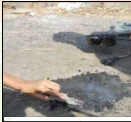
Figure 3.5: Finishing of potholes