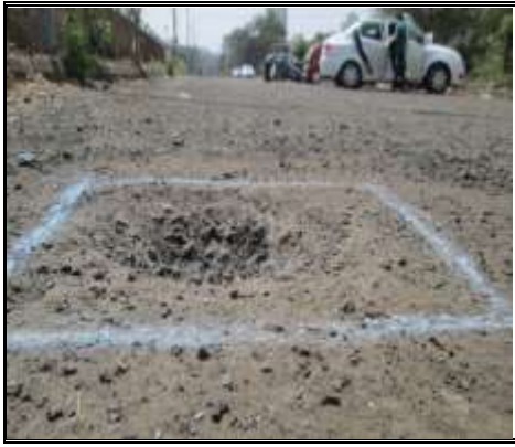
Figure 4.1: Selection and Marking of pothole