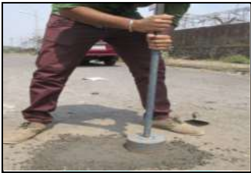
Figure 4.3: Tamping of pothole by using hammer