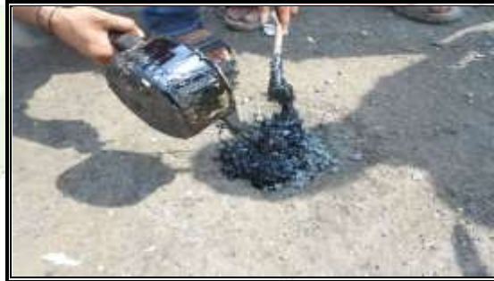
Figure 2.2: Laying of bituminous mix

Fig 1 displays the mixing of aggregates, bitumen and plastic. In this case bitumen should be heated up to 160°C and then should be utilize for mixing