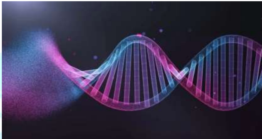
Figure 2 Secondary coiling in DNA