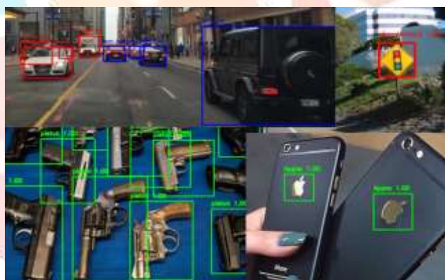
Figure 4: Informative region selection from multiple objects.

While dissimilar/different moving objects may emerge in any view point of the image and have different aspect ratios or sizes and shapes, it is a natural choice to scan the entire image with a multi-scale sliding window. This strategy can find out all feasible positions of the objects, its faults are also obvious. Due to a large number of candidate windows, it is economically expensive and creates too many unessential windows. However, if only a specified number of sliding window templates are applied, undesirable regions may be produced [9].