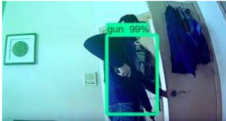
Figure 5: image of percentage of accuracy of detecting object

A confusion matrix presents the number of correct and incorrect projections made by the stratification model compared to the authentic results (target value) in the data. It is a N \times N matrix, where N represents number of target values. Accomplishment of such models is generally estimated using the data in the matrix.