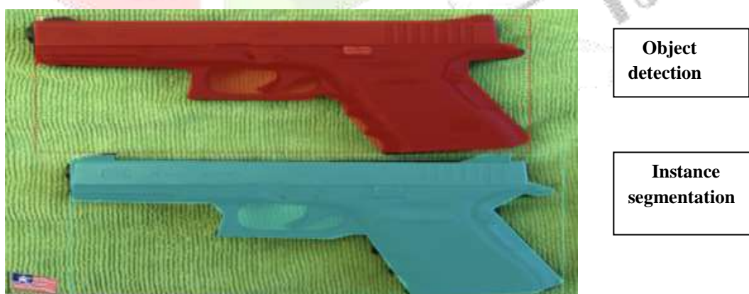
Figure 2: Image of object detection and instance segmentation