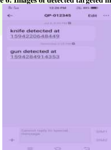
Figure 7: Alert message send to the mobile of authority