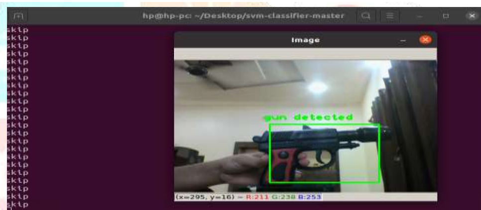
Figure 6: Images of detected targeted moving object.