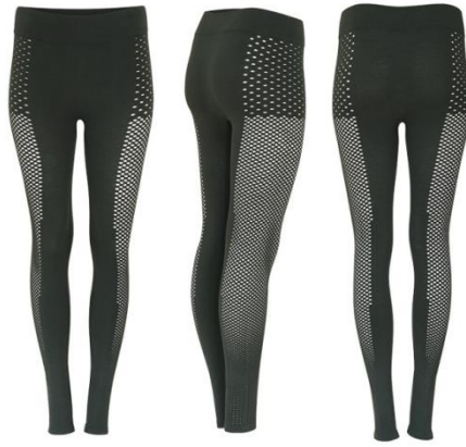
Figure 4: Bottom wear made from Seamless Garment Technology