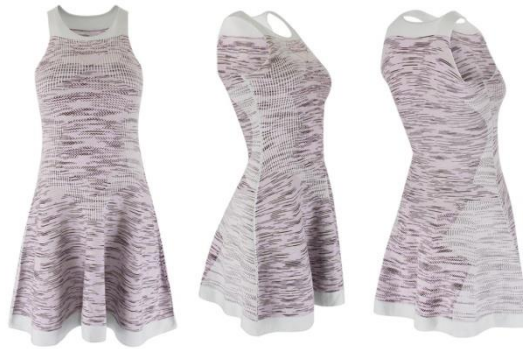
Figure 2: Garment made from whole Garment 3D Knitting Technology

Shima Seiki came with its unique capabilities in knitting and knitwear industry. One of the revolutionary in knitwear is Whole Garment 3D Knitting Technology. The entire concept of this technology is to produce seamless garments which will reduce wastage and save time and money. In the same direction comfort and consistency comes in priority for the consumers. The design of garment is configured Shima Seiki CAD and then the construction is done in Shima Seiki knitting machine with Whole Garment 3D Knitted garment.