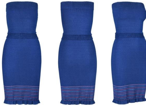
Figure 5: Indigo Seamless Knitted Dress

This knitwear collection and technology has unique seamless knitwear technology applicable to cotton indigo yarn to produce fabrics. The panels of garments are separately knitted with seamless technology. The indigo cotton yarns have its unique visual appearance due to the dyeing technique. This technology produces seamless indigo fabric with unique patterns, designs, structures, and stitching effects. The denims made from this technology got high appreciation in various trade fairs and exhibitions.