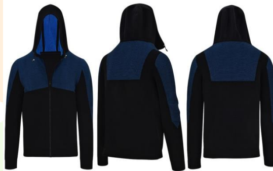
Figure 3: Full Fashion Knitted Sweatshirt

In full fashion knitting technology the panels of garment are separately knitted in flat bed knitted machine as per the design requirement and then the panels are attached with linking and inverse plaiting technique. The final product has no raw edges as the entire concept is to get fully fashion garment with comfort and zero wastage. As we all know wastage is one of the major areas which need special attention for sustainable environment.