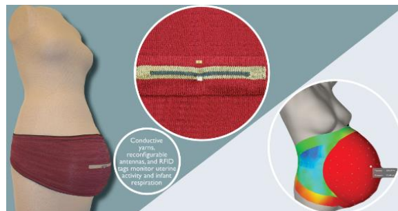
Figure 1: Smart fabric bellyband

The band is knitted in Shima Seiki flat bed knitting machine. Very thin radio frequency identification is interlaced in the knitted structure. The wireless sensors knitted in the belt help to monitor the activities of infant inside the womb. These belts are a revolution in fetal monitoring as the process is very simplified as compared to traditional monitoring systems. This technology is not only limited for pregnant women, it can be used for infant child as well as for any patient where monitoring is required.