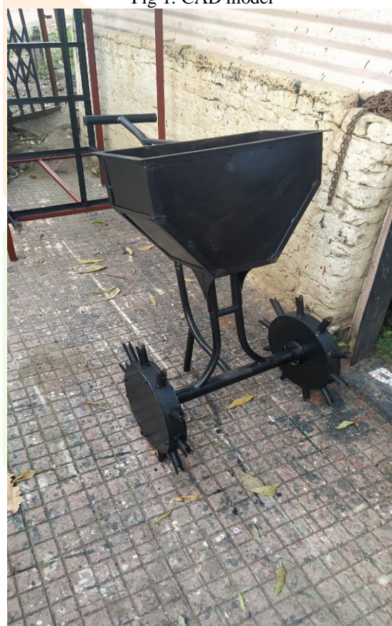
Fig 2 : Model of Roller Seed sowing machine