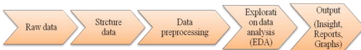
Figure 1: Methods for data preprocessing in machine learning

Pre-processing refers to the changes applied to our information before implementing in the algorithm. Data Preprocessing is a procedure that is utilized to change over the raw data into clean data collection. In other words, at whatever point the data is assembled from various sources it is gathered in raw format which isn't attainable for the examination.