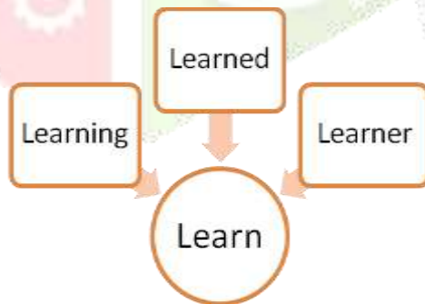
Figure 3: Example for stemming the keywords

Stemming the keywords: the root keyword is Learn