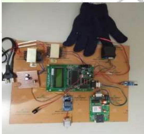
Figure 2: Prototype model of the system

To avoid accidents, the proposed system as shown in Figure 2 is designed for the stress detection of the members of the aviation crew. In this PIC16F877A it is used to connect various peripheral hardware. For measuring stress the pulse sensor and temperature sensor are used. Once the crew member abnormality is detected the message will be sent using GSM.