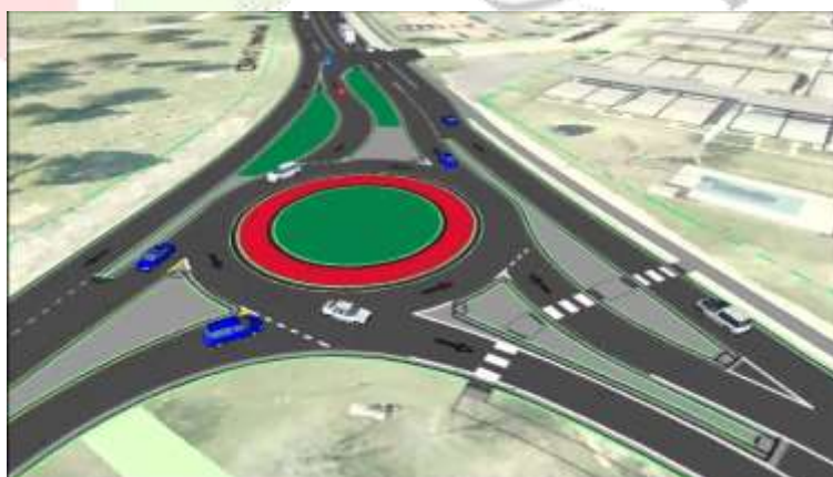
Fig 5. The device can be installed along the red circular highlighted color shown in above figure vertically to get the effective results.