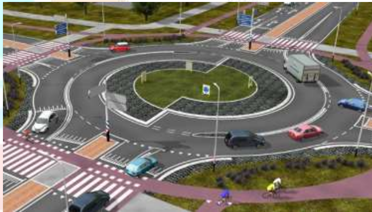
Fig 4. Figure shows the animated traffic circle, we can installed the device in the middle of traffic circle, along the roadside and in middle of two-way street i.e. in the divider.

The device can be installed in such location that there will the maximum possibilities of high pollution created and which stays in the surrounding for over a period of time. Such location are nothing but in the middle of the traffic circles, along the streets, in middle of the two-way road i.e. in the divider, etc.